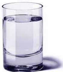
The source of NSA Norfolk Naval Shipyard's drinking water includes four surface lakes (Kilby, Meade, Cohoon, and Speight's Run) and five deep wells in the Middle Potomac Aquifer.

NAVFAC Mid-Atlantic Environmental 757-341-0426